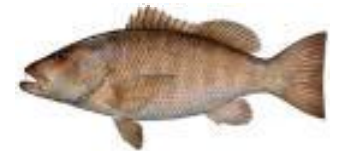
Pacific Dog Snapper